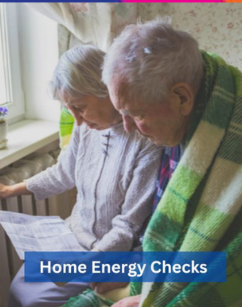
Home Energy Checks