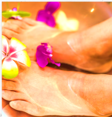
SIMPLY NAILS FOOTCARE